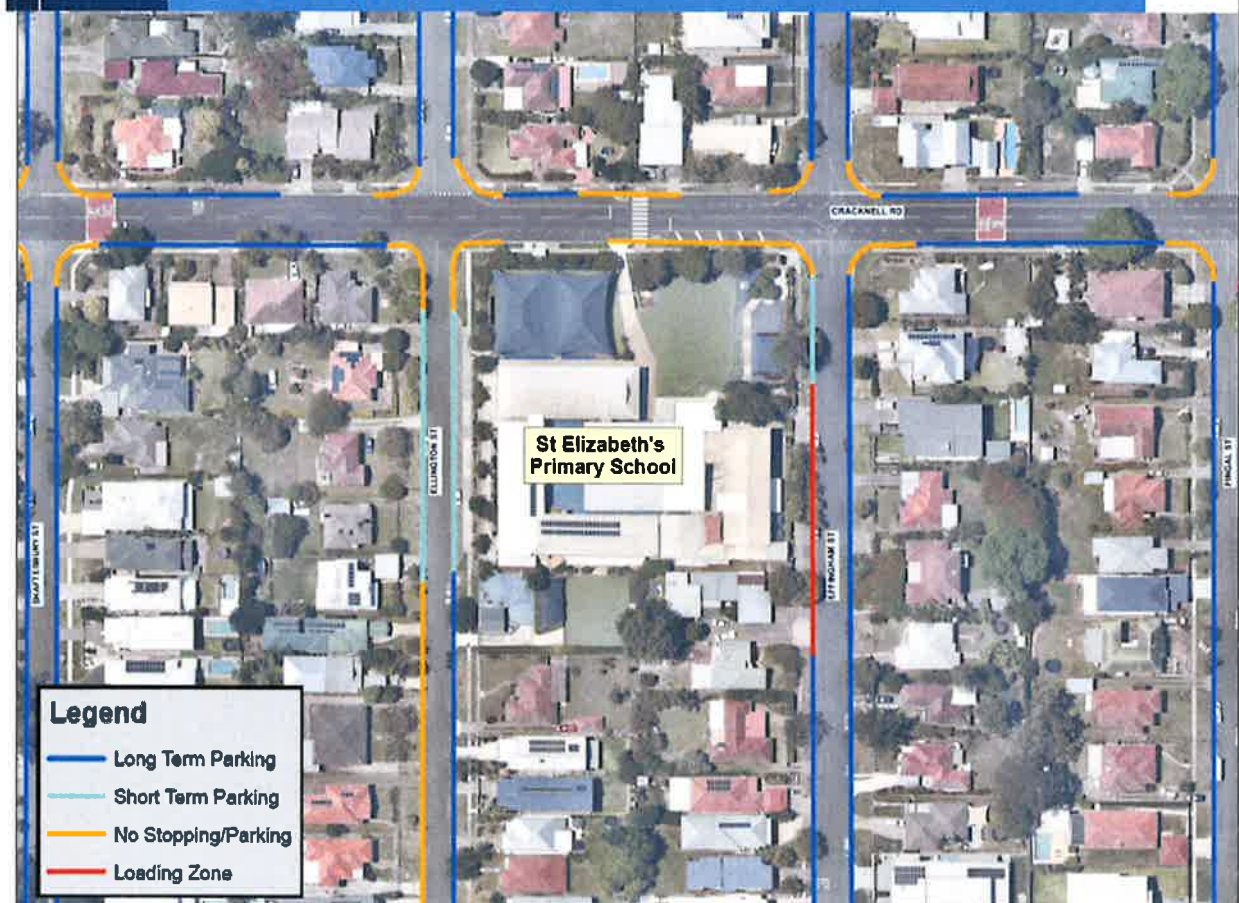
Figure 2: Map of parking areas