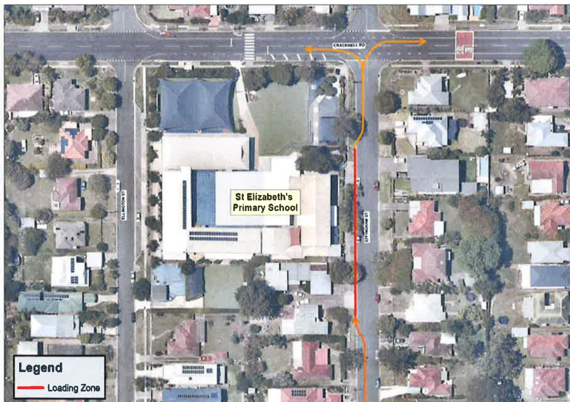
Figure 1: Map of drop and go (passenger loading) zones

Bus: Bus zones are reserved for school and commuter bus services only. Motorists who unlawfully park in these spaces may be reported to Council's Suburban Safety and Parking Compliance team and/or the Queensland Police Service.